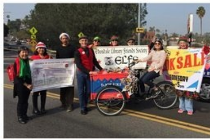
Glassell Park Tree Lighting